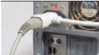
Plugs into computer's power port