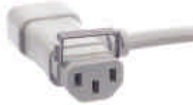
Installs permanently into computer power port with retainer clip